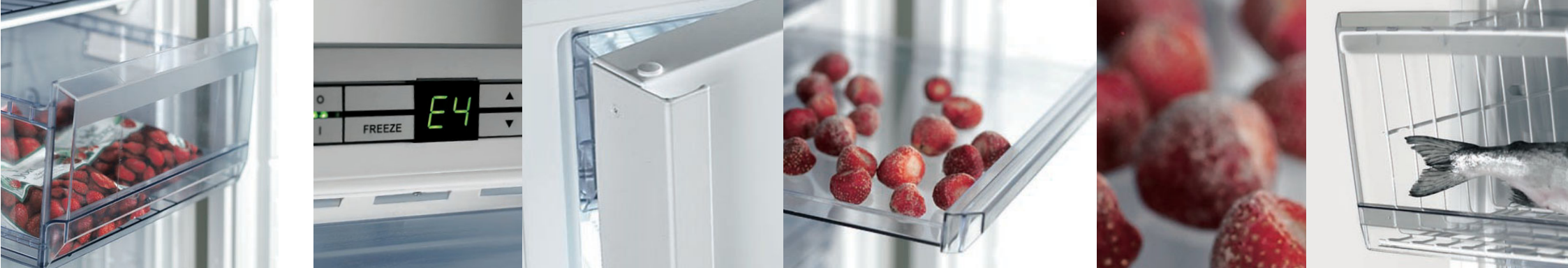
FS 230 230-litre freezer, 155 cm in height