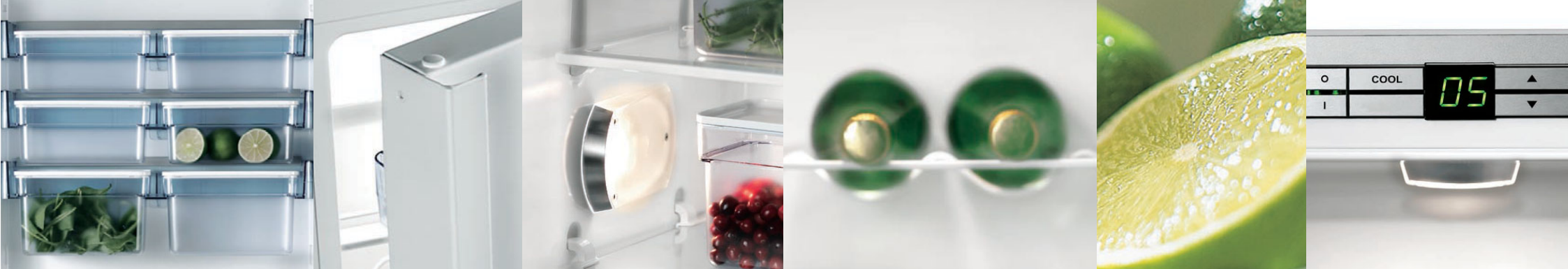
KS 290 286-litre refrigerator, 155 cm in height